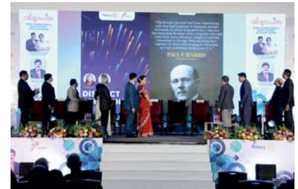
Launching of Digital District Directory