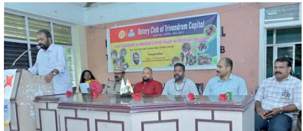
RC Trivandrum Capital Honouring Scuba Divers as part of Water & Sanitation Project