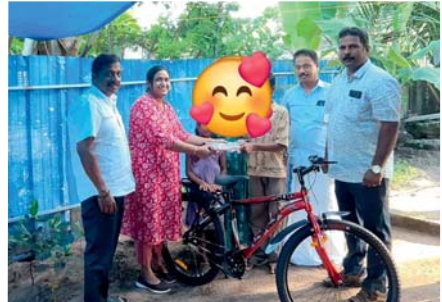
RC Alleppey Greater Bicycle given to 7th Std orphan