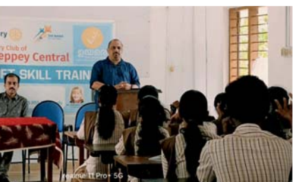
RC Alleppey Central Soft skill training at NS Higher Secondary School, Nedumudi