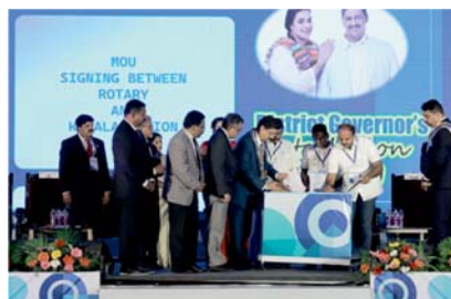
Signing of MOU with Kerala Vision