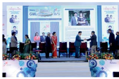
Release of GML by RI Director