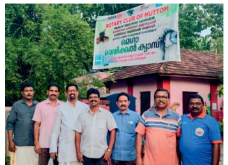
RC Muttom Mega Medical Camp