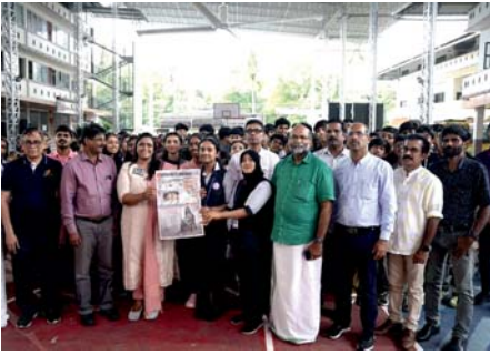
RC Alleppey Greater Vayanakalari at Alpha Genius Integrated School, Pathirapally, Alappuzha.