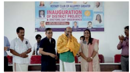
RC Alleppey Greater Honoured Dr. K.S. Manoj, former MP