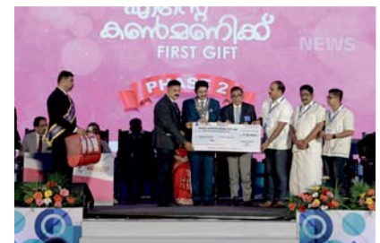
Inauguration of Project Ente Kanmanikku