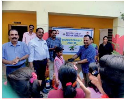
RC Kollam Royal City Planetree @ KVSNDP UP School