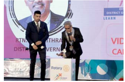
Vidyapeetam called to order