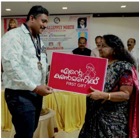
RC Alleppey North