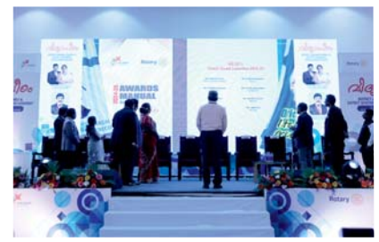
Release of Awards Manual