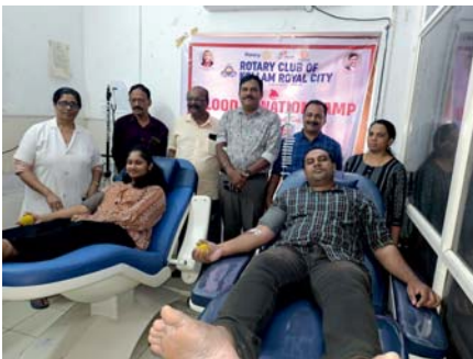
RC Kollam Royal City Blood Donation Camp at IMA Blood Bank