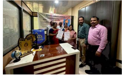
RC Haripad MOU signed with Kasthurba Para Medical Institute.