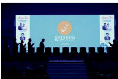
Inauguration of District Project Uyare