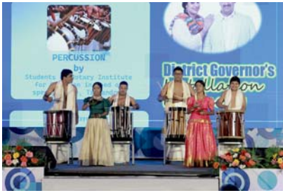
Musical performance Rotary Institute Students