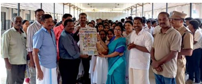
RC Cherthala Green City Ente Kaumudi at SN Trust HSS