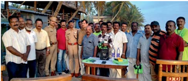
RC Kazhakuttom Uniforms to volunteers of Kadalora Jagratha Samith