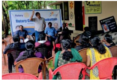
RC Kazhakuttom Uyare project inaugurated at Karichara Ankanvadi.