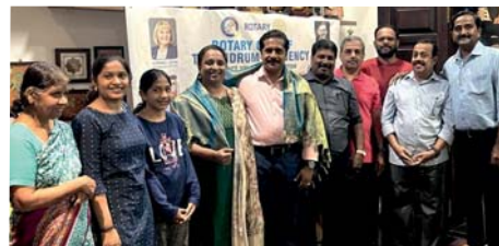
RC Trivandrum Residency Honoured doctors on Doctors Day