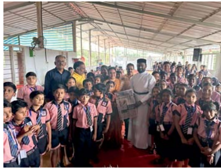
R C Vaikom Lake City Vayanakalari in association with Malayala Manorama