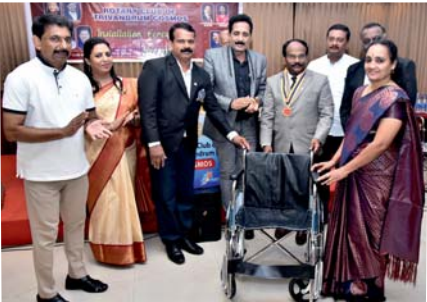
RC Trivandrum Cosmos Donated Wheelchair to PHC Panavur and RCC Trivandrum