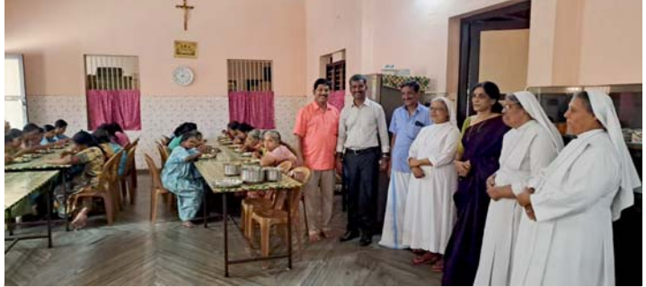
RC Cherthala Green City Lunch for inmates of Sneha Bhavan Kalavoor on every Monday for one year