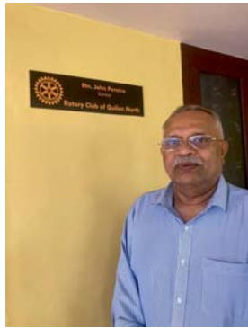
RC Quilon North A name board installed with the Rotary logo, member's name, and classification in front of every club member's residence.