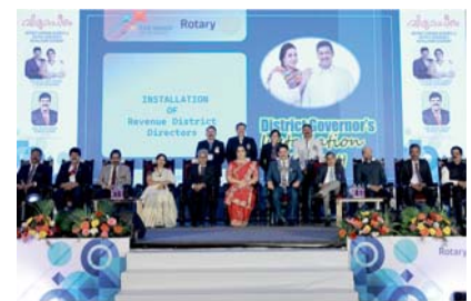
Installation of Revenue District Directors