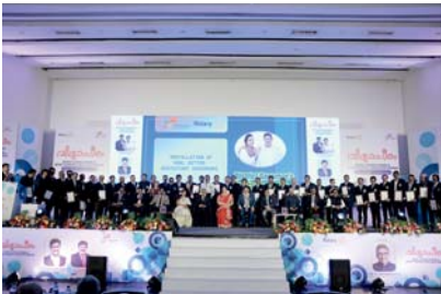
Installation of Assistant Governors