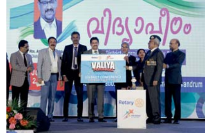
Inauguration of Dist. Conf. Regn.

The District Learning Assembly was altogether a memorable experience.