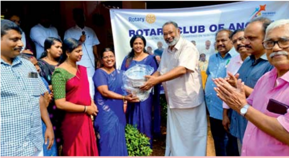
RC Anchal Donated 200 steel lunch plates to MGLPS Manalil, Yeroor