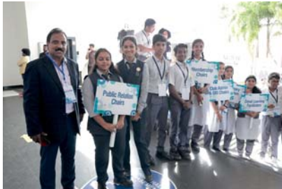
Interactors give guidance to BOS