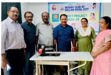
RC Kollam Royal City Assistance to a girl to learn Stitching & Embroidery works.