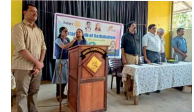
RC Kazhakuttom Quiz @ SNGHSS Chempazhanthy