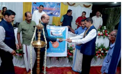
RC Aranmula First instalment of fees for ZAP Training for a student.