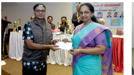
RC Desinganad Kollam Financial Assistance to a physically challenged photographer.