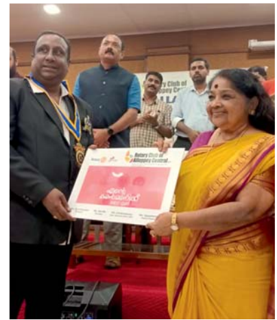
RC Alleppey Central