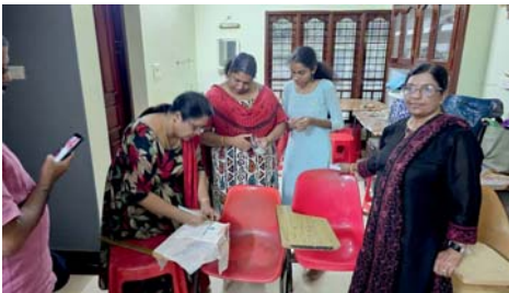
RC Quilon Heritage Skill development programme for women