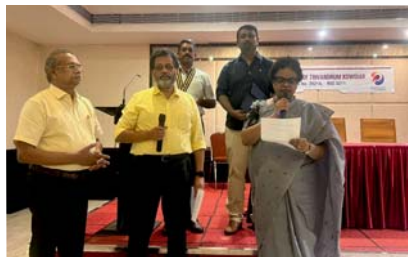
RC Trivandrum Kaudiar Inducted 2 New Members