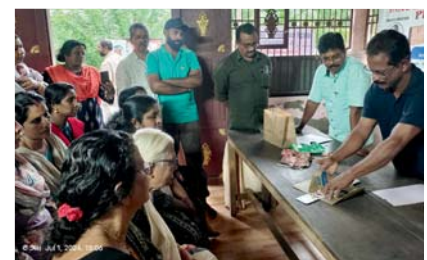
RC Muttom Training programme on Paper Bag Making