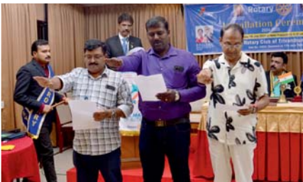
RC Trivandrum Inducted 3 New Members