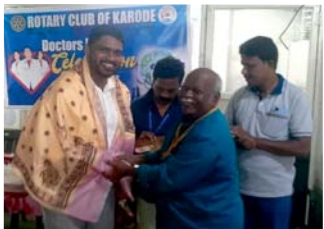
RC Karode Honoured the doctors at Family Health Centre, Karode