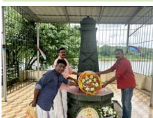
RC Aranmula Tribute at Veerjawan Jyothi Aranmula