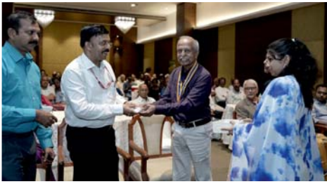
RC Trivandrum Suburban Organic Soap Hand-made by students under UYARE Project