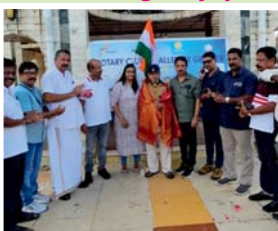
RC Alleppey Greater Tribute at Global Peace Palace, Alleppey