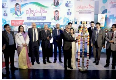
Lighting the ceremonial lamp