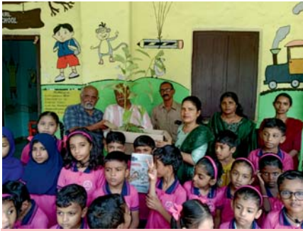
RC Alleppey Coir City Planetree - Saplings to C M S School