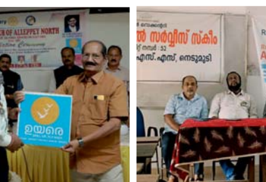
RC Alleppey North Inauguration of District Project Uyare.