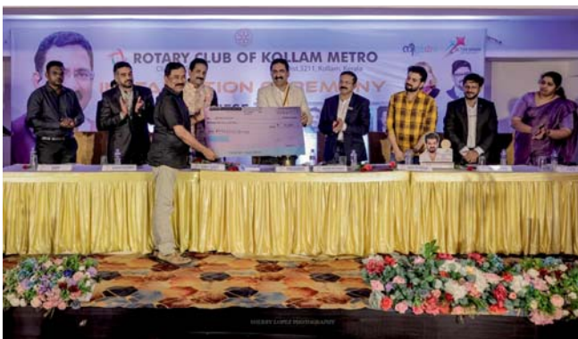
RC Kollam Metro