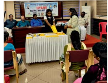
RC Puthuppally Training Class in paper bag making under Uyare Project.