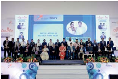
Installation of District Core Team 2024-25