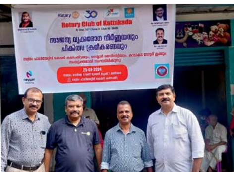
RC Kattakada - Kidney Disease Detection Camp