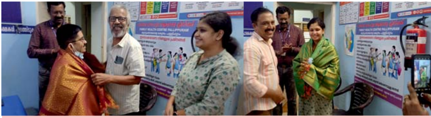
RC Vembanad Pallipuram Honoured the doctors at Pallippuram Health Center