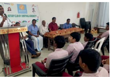
RC Cherthala Green City Class on soft skills development at Sree Sankara HSS, Cherthala South.