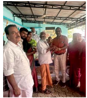
R C Vaikom Lake City Karkkidakakanji distribution for 7 days