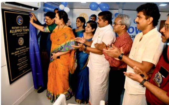
RC Alleppey Town Charter Presentation of RC Alleppey Town at Coircraft Convention Centre, Alleppey