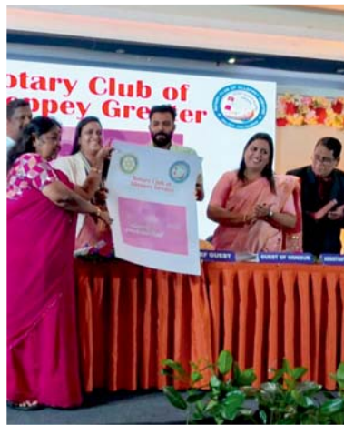
RC Alleppey Greater