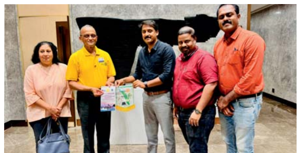
RC Trivandrum Metroplis Flag Exchange with RC Nazik at Hotel Hyatt Regency