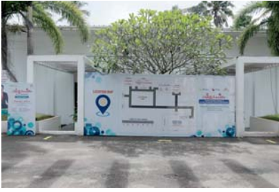
Route map to breakout sessions