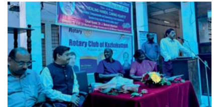
RC Kazhakuttom Doctors Day at CSI Mission Hospital