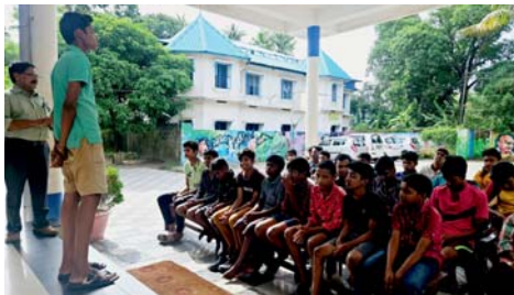
RC Quilon Cashew City Skill development programme for children at Juvenile Home, Kollam